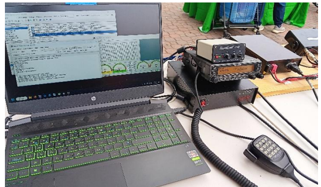
Winlink set-up allowed ARC to send email to visitors' email.