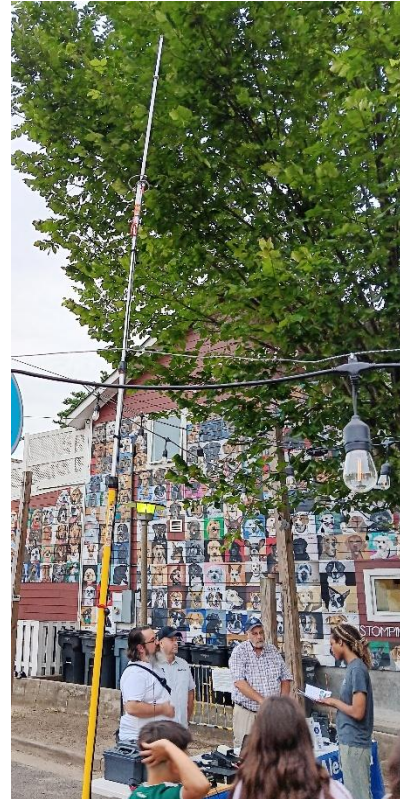
ARC members Sandy-KQ4DNE, Stex-K4IEW, and Sean-K4KBK greet visitors at National Night Out, Oct. 5. A painters pole hoisted their antenna. (Story below.)