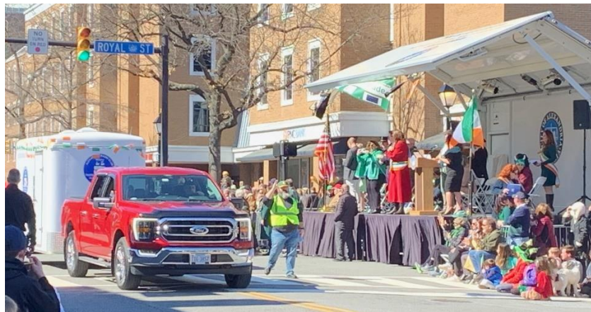
Passing the reviewing stand.

St. Patrick's Day Parade, Alexandria, VA, March 4, 2023 | OFFICIAL VIDEO— this is the recording of the whole livestream!! Ballyshaners present the St. Patrick's Day Parade in Alexandria, VA find yourselves—see... | By The Zebra Press - GOOD News in A < https://fb.watch/j4d_pSQh13/?mibextid=qC1gEa >