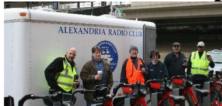
Our trailer at the George Washington Birthday Parade